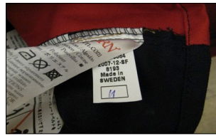
Example of date stamp on BabyBjörn® BabySitter Balance