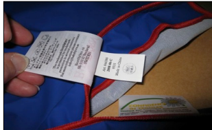
Example of date stamp on BabyBjörn® Eat N Play Smock