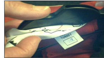
Example of date stamp on all BabyBjörn® baby carriers