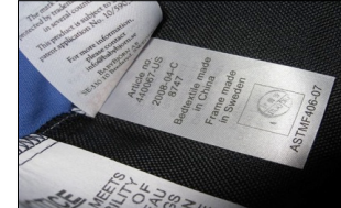
Example of date stamp on BabyBjörn® Travel Crib Light