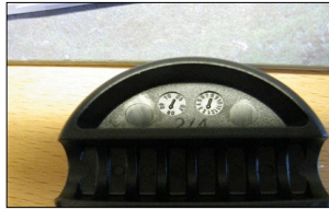
Example of date stamp on BabyBjörn® plastic products