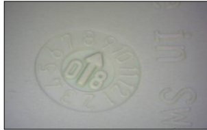
Example of date stamp on BabyBjörn® plastic products

See label on each product. For a date label sample of each product, please see pictures below.