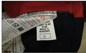
Example of date stamp on BabyBjörn® BabySitter Balance