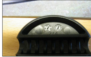
Example of date stamp on BabyBjörn® plastic products