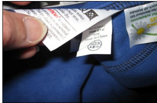
Example of date stamp on BabyBjörn® Cover for baby carrier