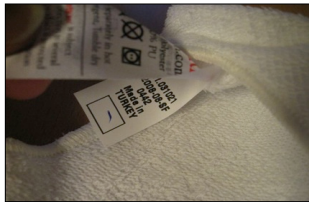
Example of date stamp on BabyBjörn® Bib for Carrier