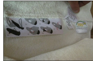
Example of date stamp on BabyBjörn® Cozy Cover.