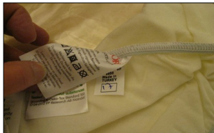
Example of date stamp on BabyBjörn® Fitted Sheet