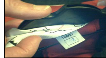
Example of date stamp on all BabyBjörn® baby carriers