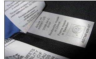
Example of date stamp on BabyBjörn® Travel Crib Light