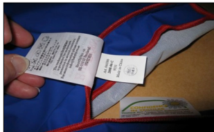
Example of date stamp on BabyBjörn® Eat N Play Smock