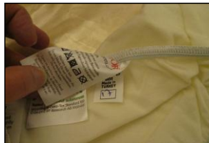
Example of date stamp on BabyBjörn® Fitted Sheet