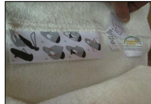
Example of date stamp on BabyBjörn® Cozy Cover.