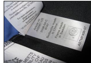
Example of date stamp on BabyBjörn® Travel Crib Light