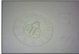
Example of date stamp on BabyBjörn® plastic products

See label on each product. For a date label sample of each product, please see pictures below.