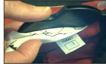
Example of date stamp on all BabyBjörn® baby carriers