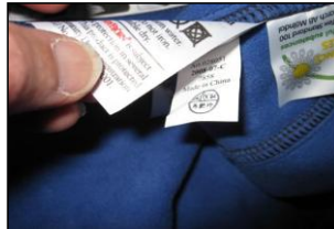
Example of date stamp on BabyBjörn® Cover for baby carrier