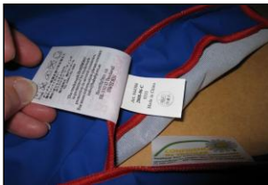
Example of date stamp on BabyBjörn® Eat N Play Smock