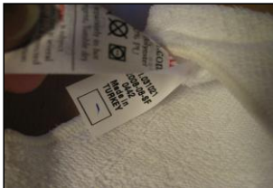
Example of date stamp on BabyBjörn® Bib for Carrier