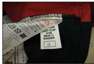
Example of date stamp on BabyBjörn® BabySitter Balance