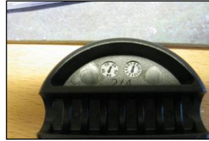
Example of date stamp on BabyBjörn® plastic products